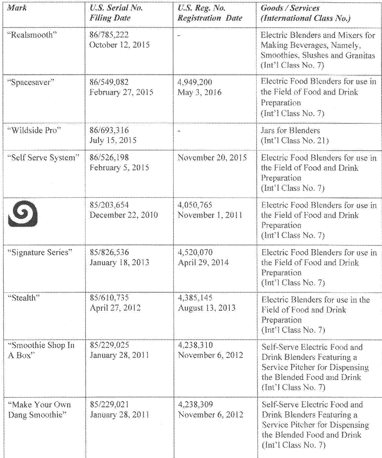
EXHIBIT B TO RELEASE OF SECURITY INTEREST U.S. Trademarks