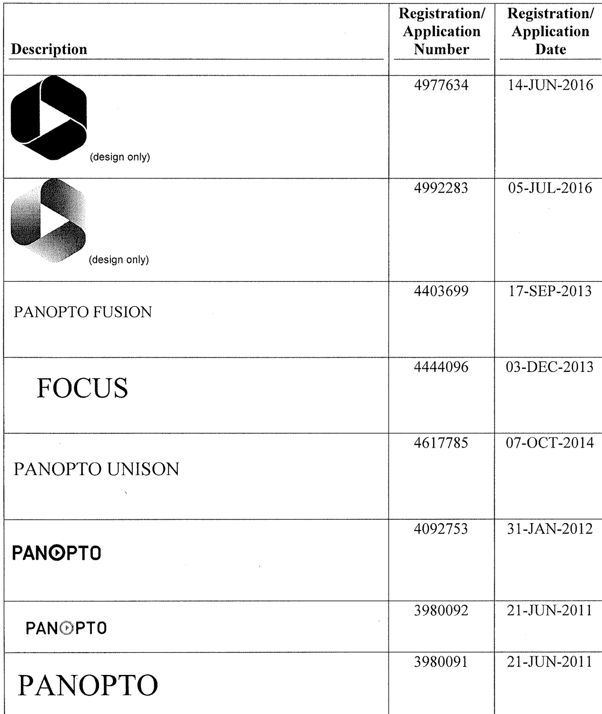
EXHIBIT C TRADEMARKS