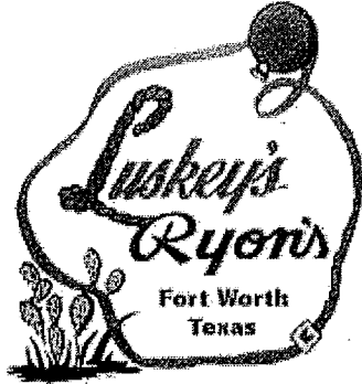
EXHIBIT B TO BILL OF SALE

ORIGINAL LOGO-USED IN MOST MERCHANDISE THROUGH THE LATE '60's. (THE RYON'S WAS RECENTLY ADDED) THIS LOGO HAS NOT BEN USED SINCE THE '60's.