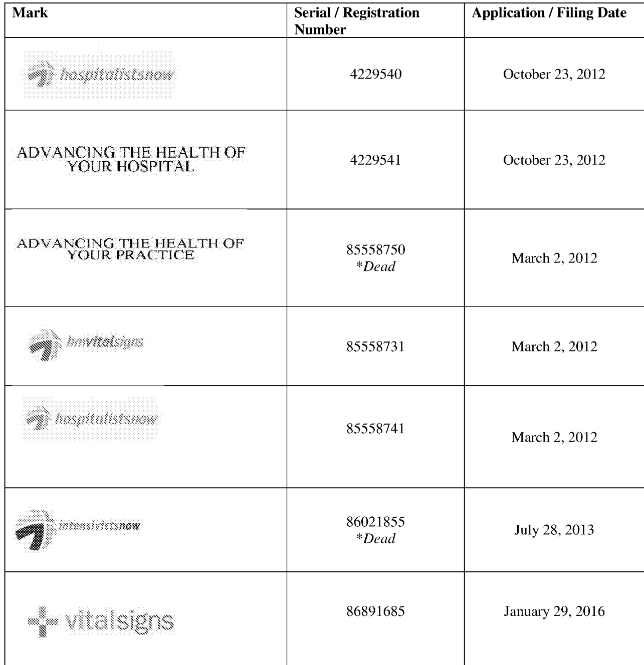
EXHIBIT C TRADEMARKS