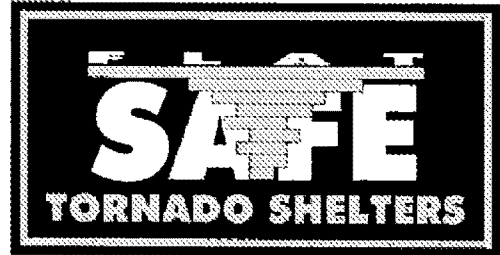
Figure 1 - TM No. 3,927,285