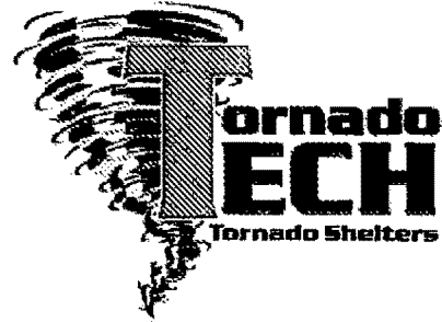
Figure 3 - TM No. 4,106,076

In addition to assigning the foregoing described specific intellectual property to Assignee, all appurtenant intellectual property, technology, research, know-how, and the like are also conveyed and assigned by Assignors to Assignee. It is the intent of Assignors to retain no right, title, or interest in and to the intellectual property described herein.