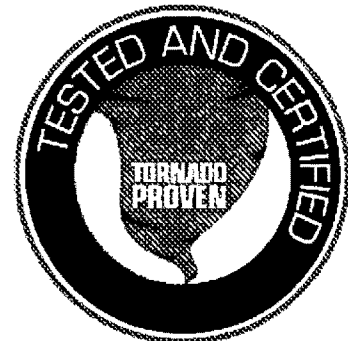
Figure 2 - TM No. 4,033,833