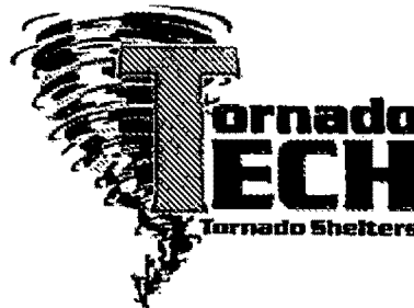
Figure 3 - TM No. 4,056,096

In addition to assigning the foregoing described specific intellectual property to Assignee, all appurtenant intellectual property, technology, research, know-how, and the like are also conveyed and assigned by Assignors to Assignee. It is the intent of Assignors to retain no right, title, or interest in and to the intellectual property described herein.