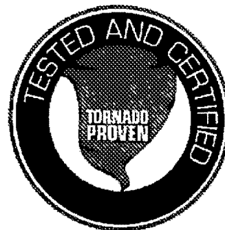
Figure 2 - TM No. 4,033,833