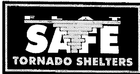
Figure 1 - TM No. 3,972,285