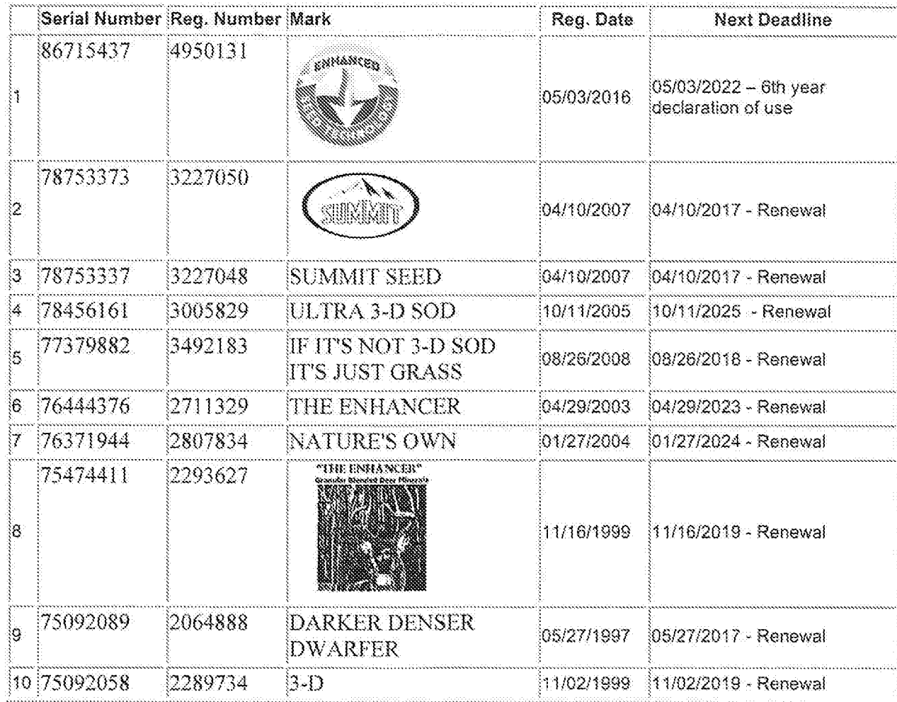
EXHIBIT A TRADEMARKS