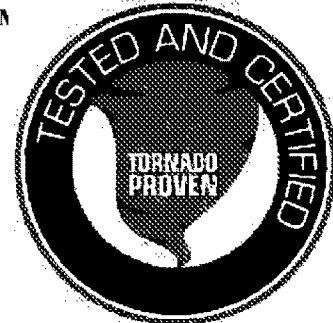
Figure 2 - TM No. 4,033,833