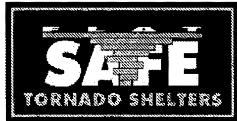
Figure 1 - TM