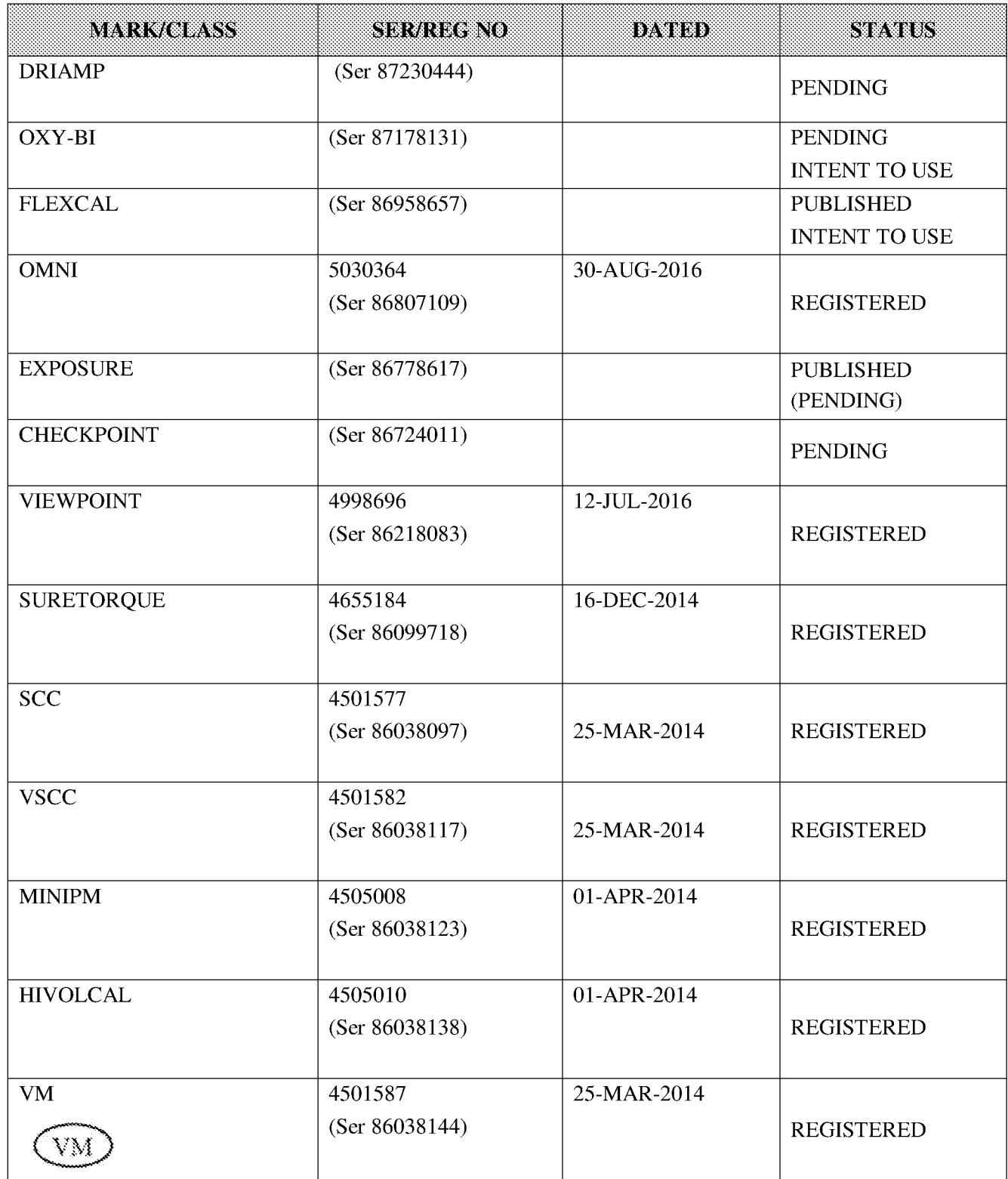
Exhibit A - SCHEDULE OF TRADEMARKS