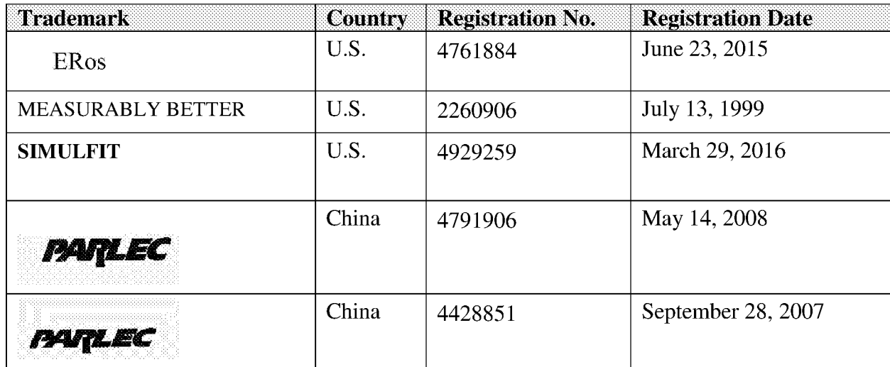
EXHIBIT A TO TRADEMARK ASSIGNMENT