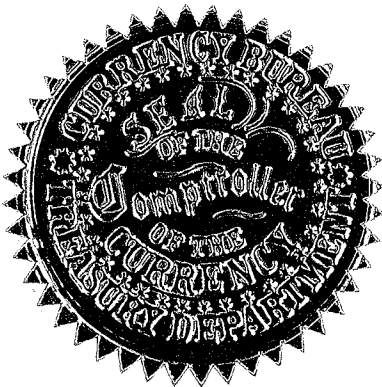
Comptroller of the Currency

IN TESTIMONY WHEREOF, today, February 19, 2013, I have hereunto subscribed my name and caused my seal of office to be affixed to these presents at the U.S. Department of the Treasury, in the City of Washington, District of Columbia.