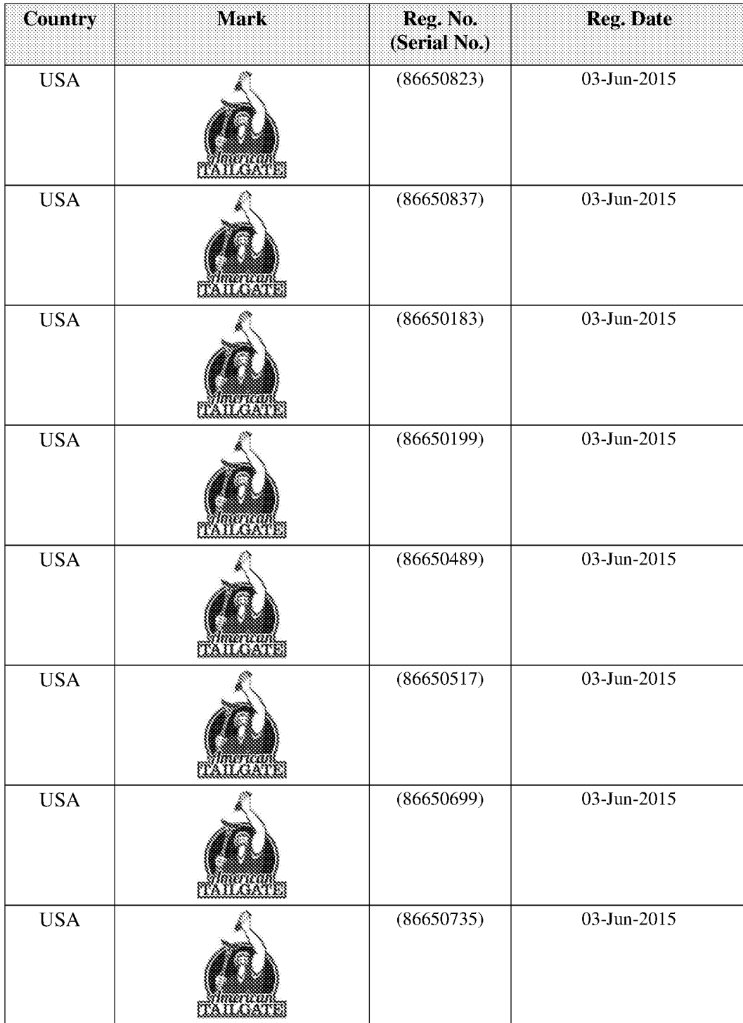
EXHIBIT A RELEASED TRADEMARKS