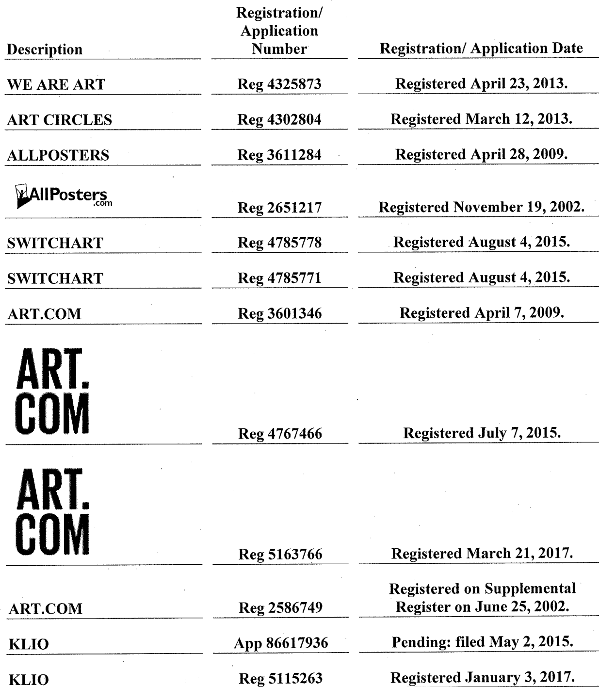
EXHIBIT C TRADEMARKS