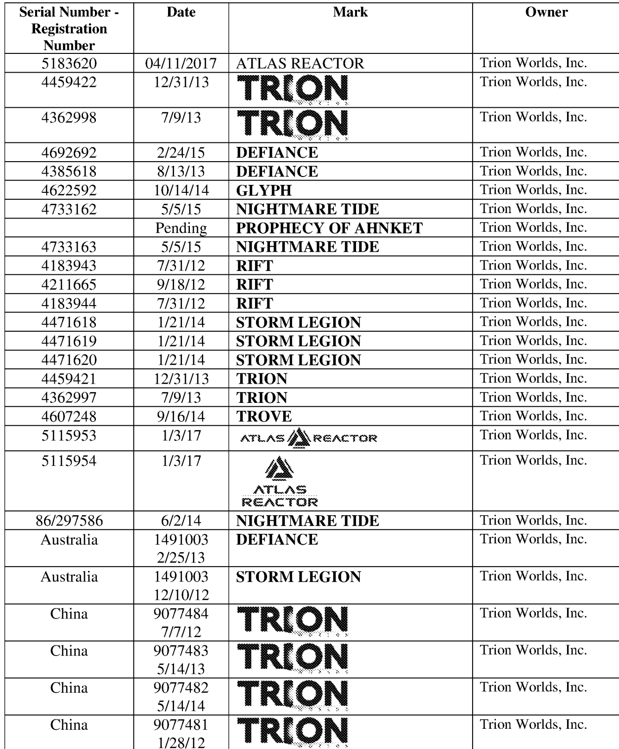
EXHIBIT 1 Trion Worlds, Inc. Trademark Schedule