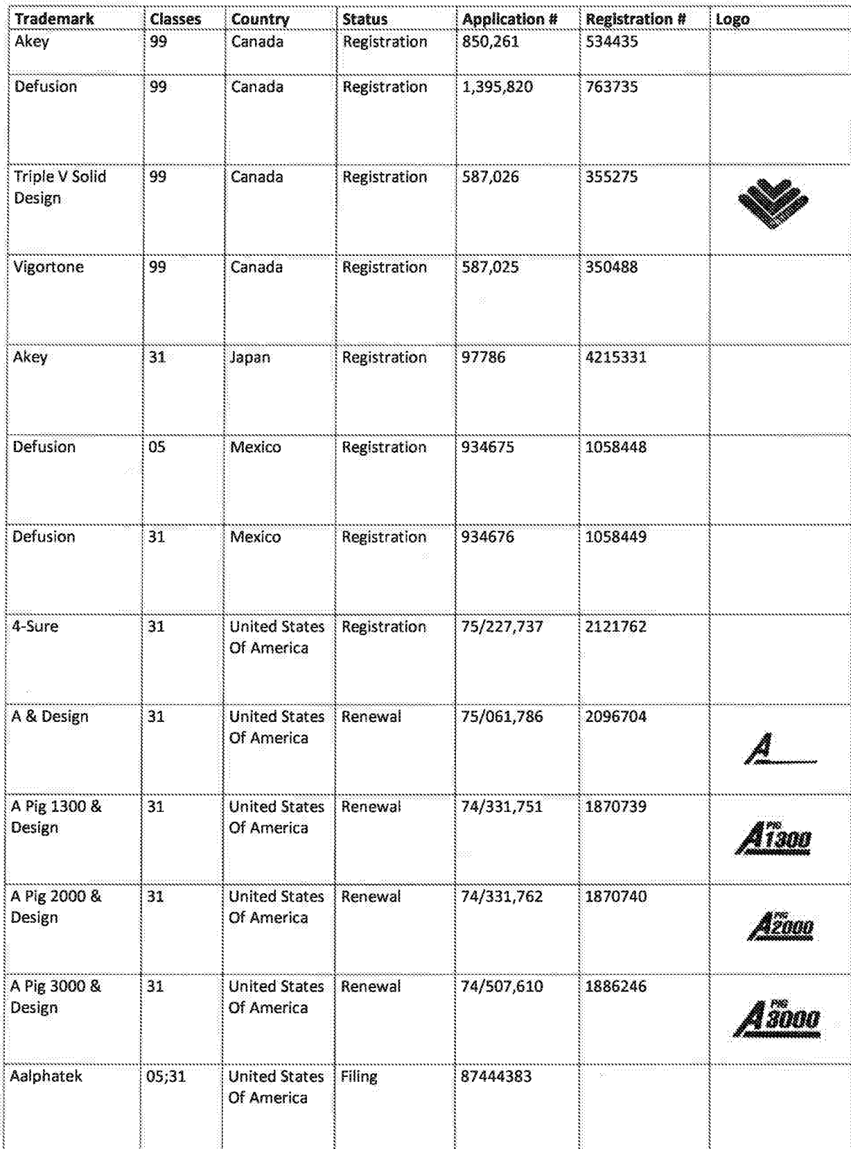
Exhibit A to Trademark Assignment PROVIMI NORTH AMERICA, INC.