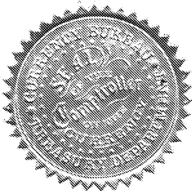
Acting Comptroller of the Currency

IN TESTIMONY WHEREOF, today, June 12, 2017, I have hereunto subscribed my name and caused my seal of office to be affixed to these presents at the U.S. Department of the Treasury, in the City of Washington, District of Columbia.