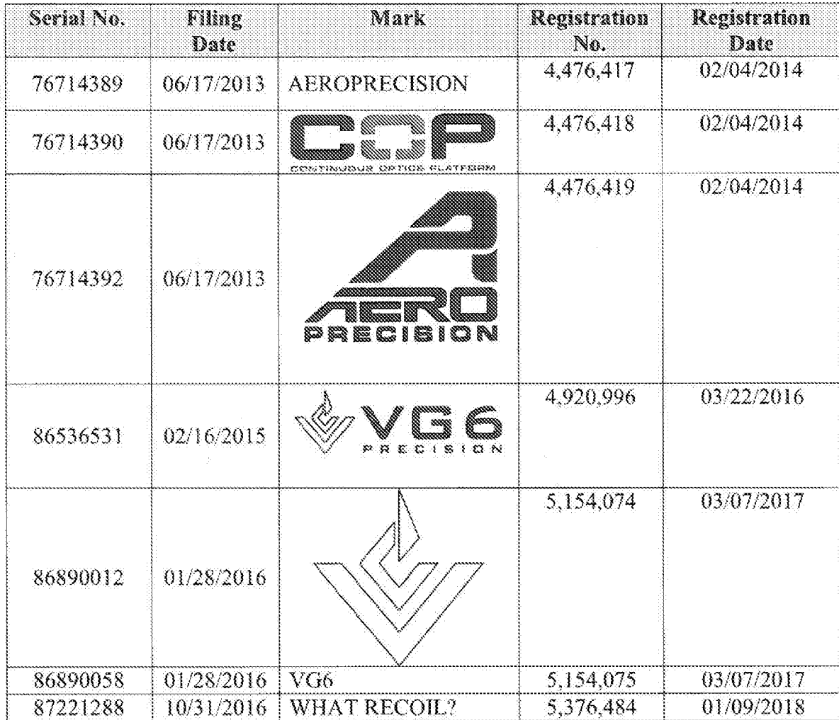
EXHIBIT A TO RELEASE OF SECURITY INTEREST IN TRADEMARKS