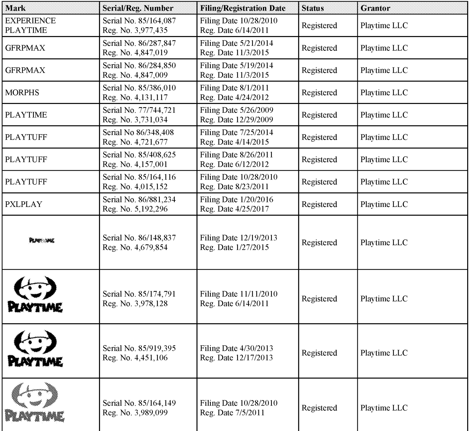
EXHIBIT A TRADEMARKS