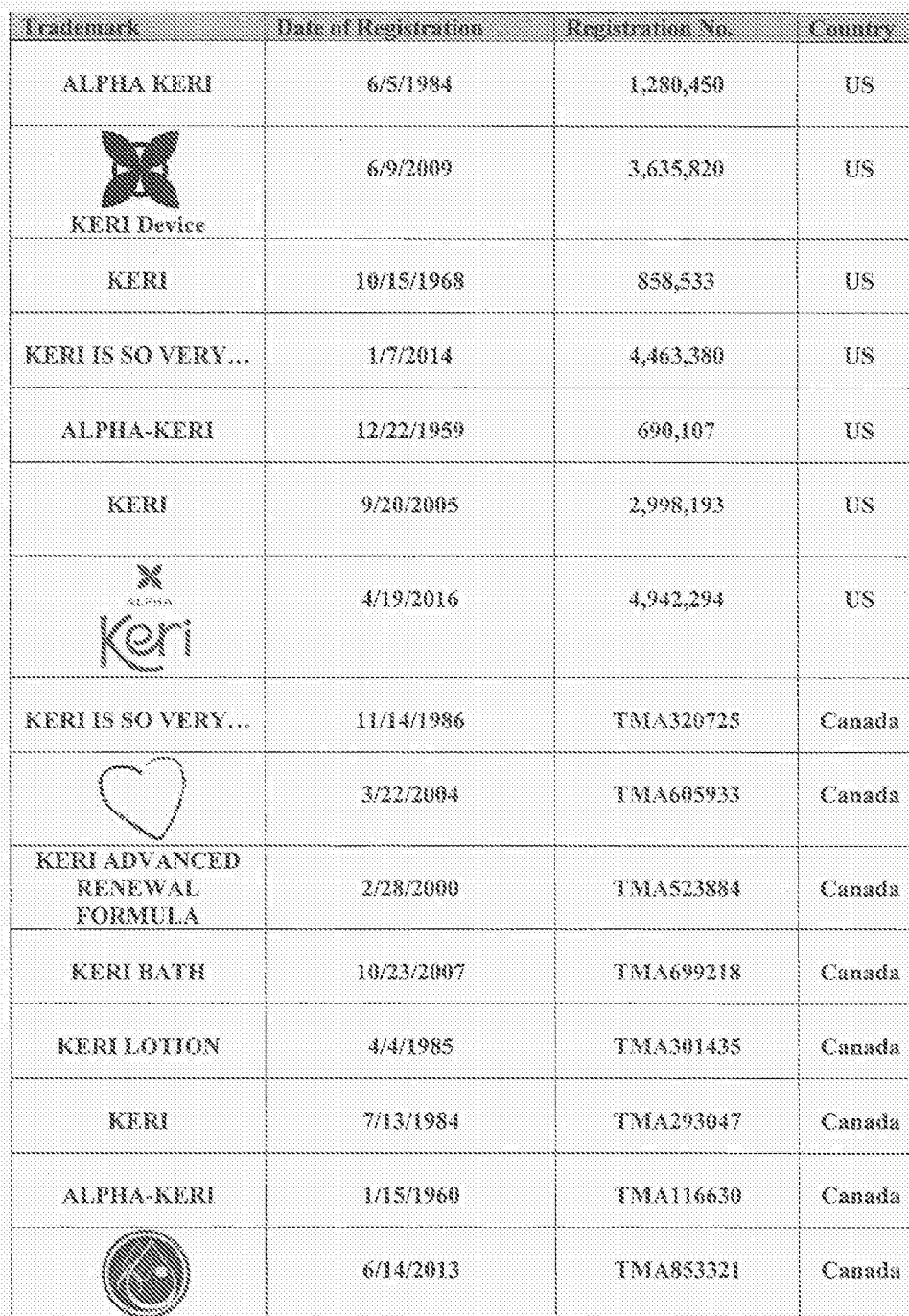
EXHIBIT A SCHEDULE OF TRADEMARKS