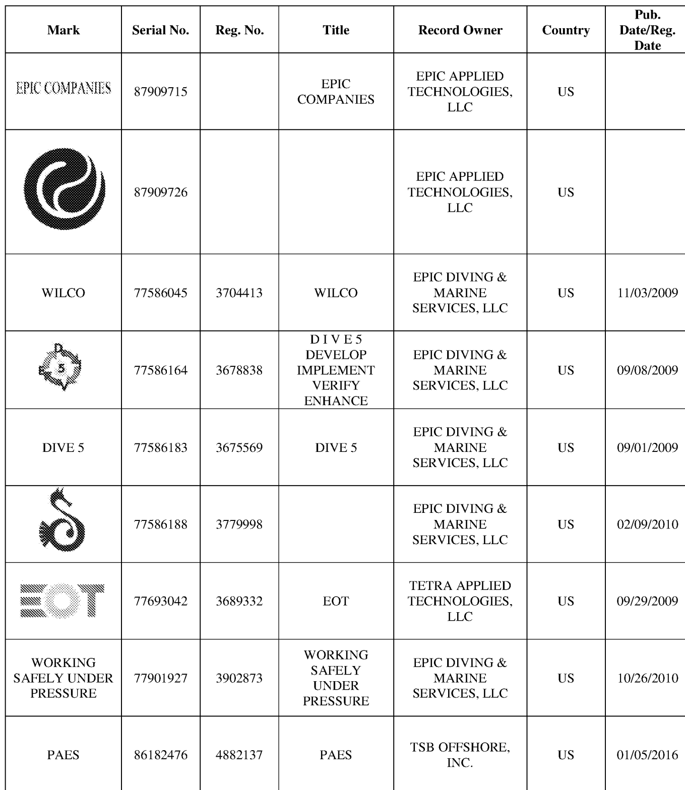
Exhibit C Trademarks