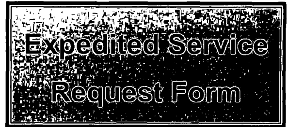
EXHIBIT 21 FM 12:39

This form MUST be completed and placed on top of EACH document submission (so it can be readily identified as a request for expedited review and processing).