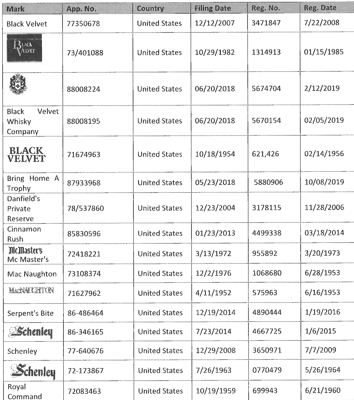
EXHIBIT A - TRADEMARKS