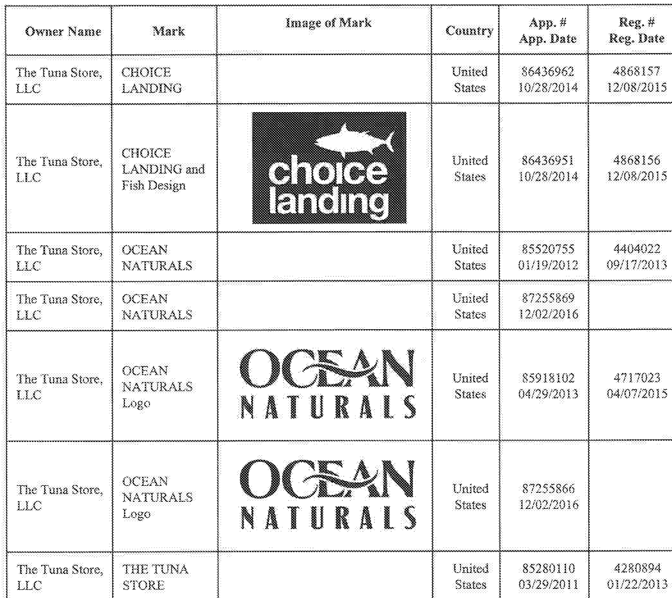
EXHIBIT A - United States Trademarks