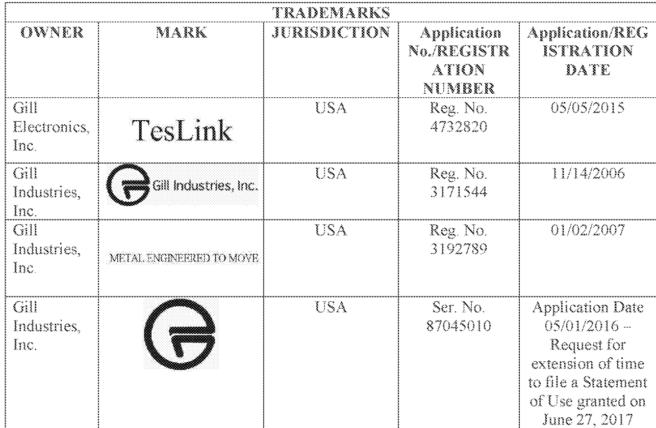
EXHIBIT B TRADEMARKS