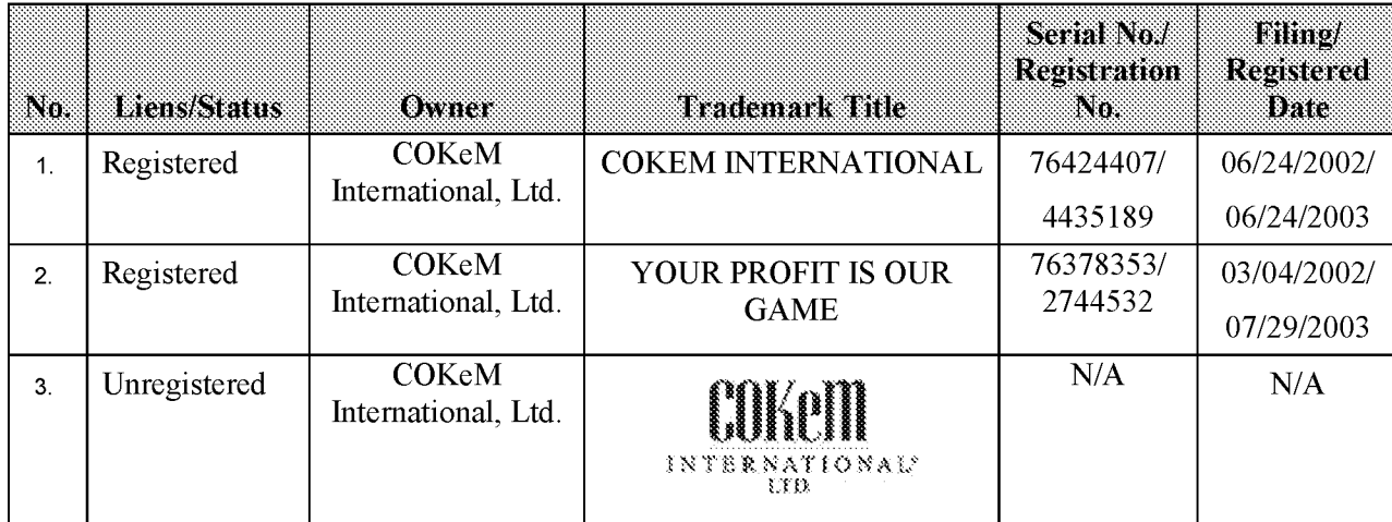
EXHIBIT B TRADEMARKS