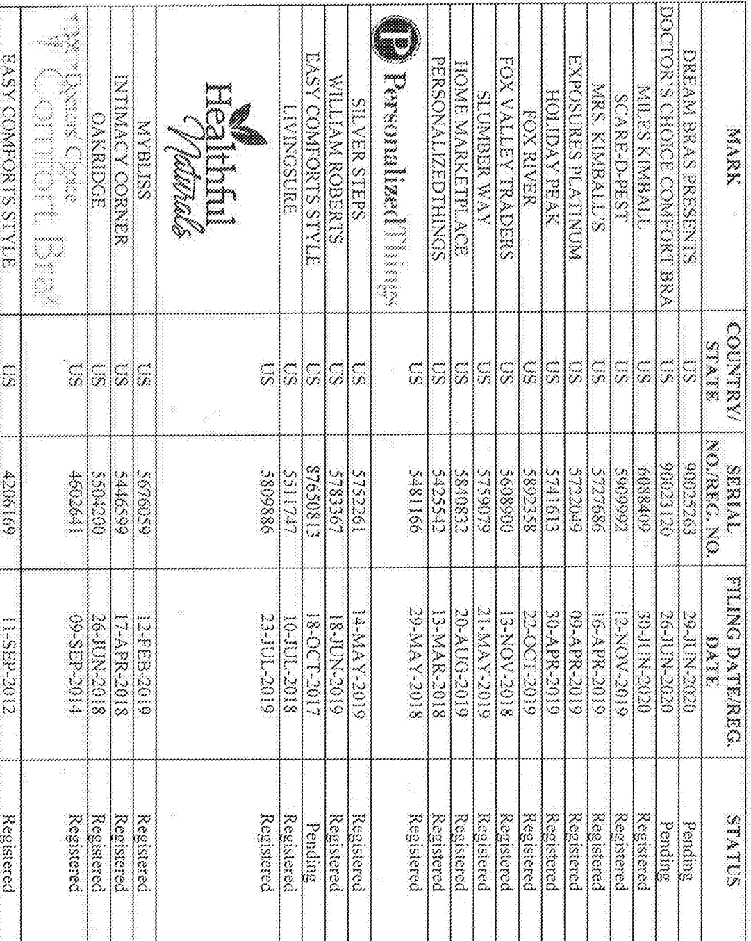
EXHIBIT A TRADEMARKS