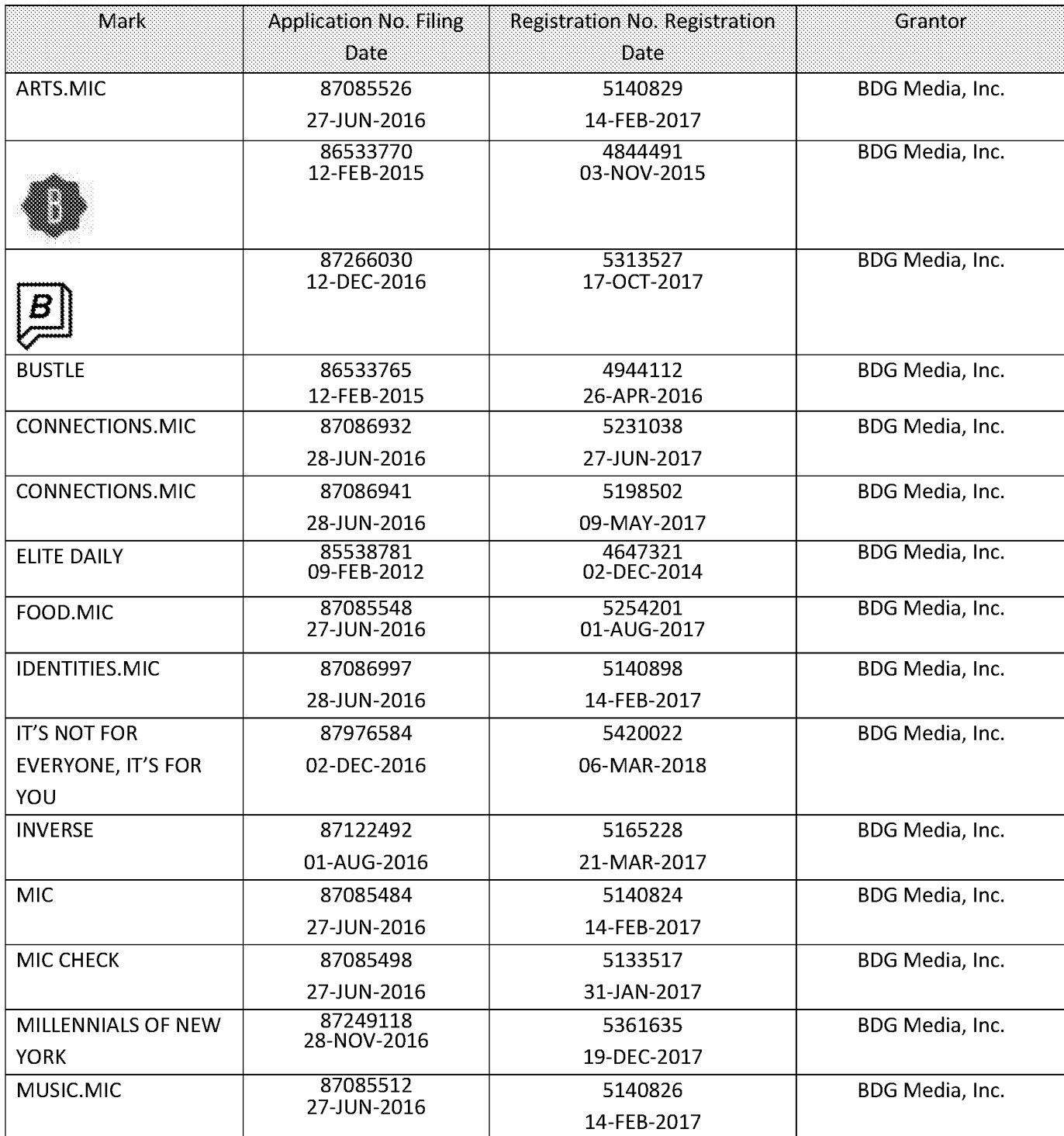
EXHIBIT C TRADEMARKS