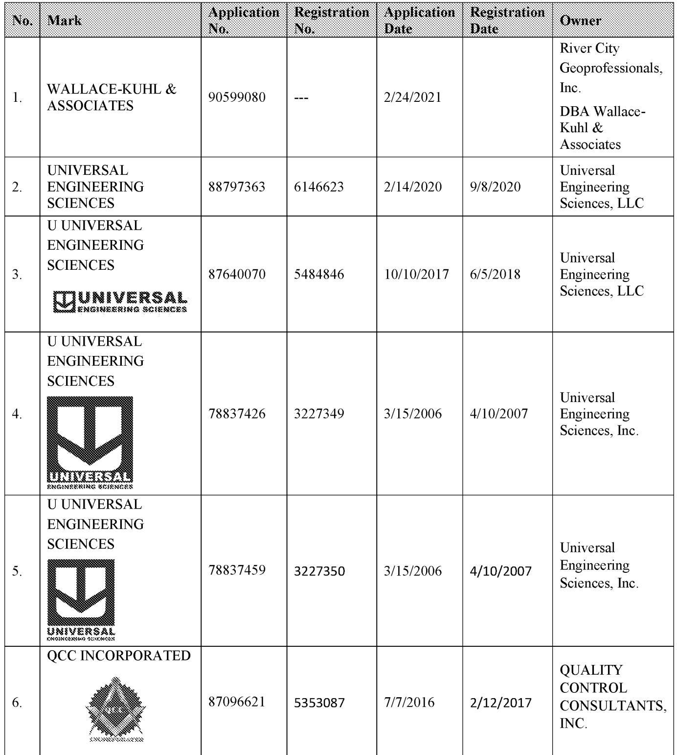
Exhibit A - SCHEDULE OF TRADEMARKS