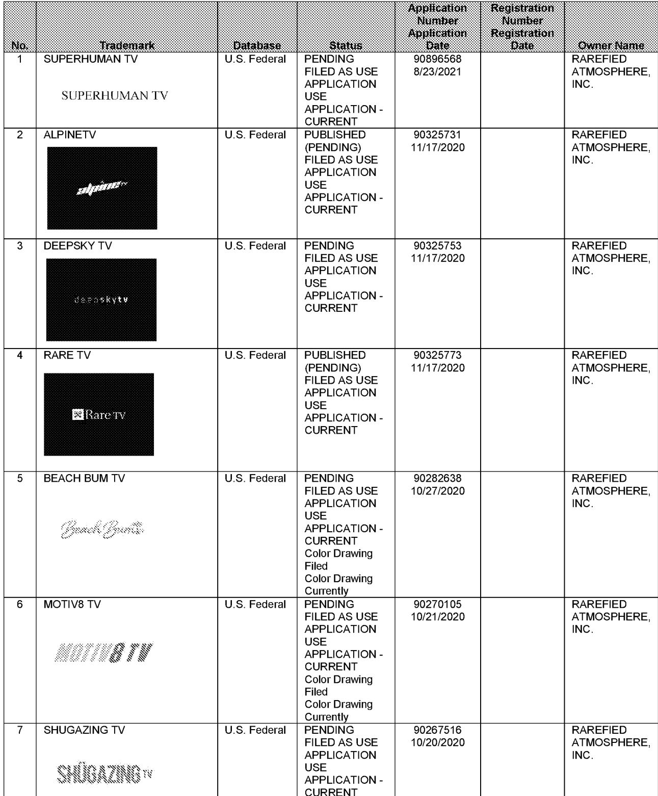
EXHIBIT B TRADEMARKS