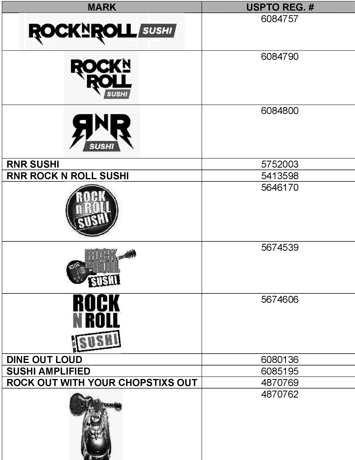
EXHIBIT A TRADEMARK SCHEDULE