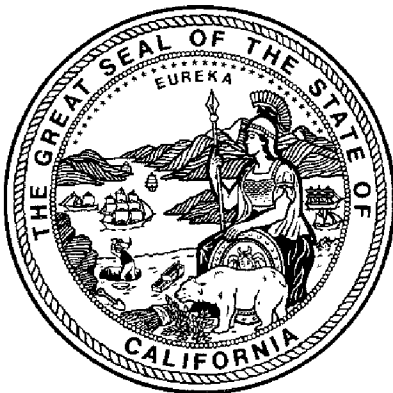
ALEX PADILLA Secretary of State

IN WITNESS WHEREOF , I execute this certificate and affix the Great Seal of the State of California this day of May 30, 2020.