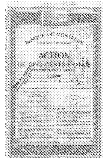
Share of the Banque de Montreux, issued 20 November 1900. Société anonyme were common in Switzerland at this time.