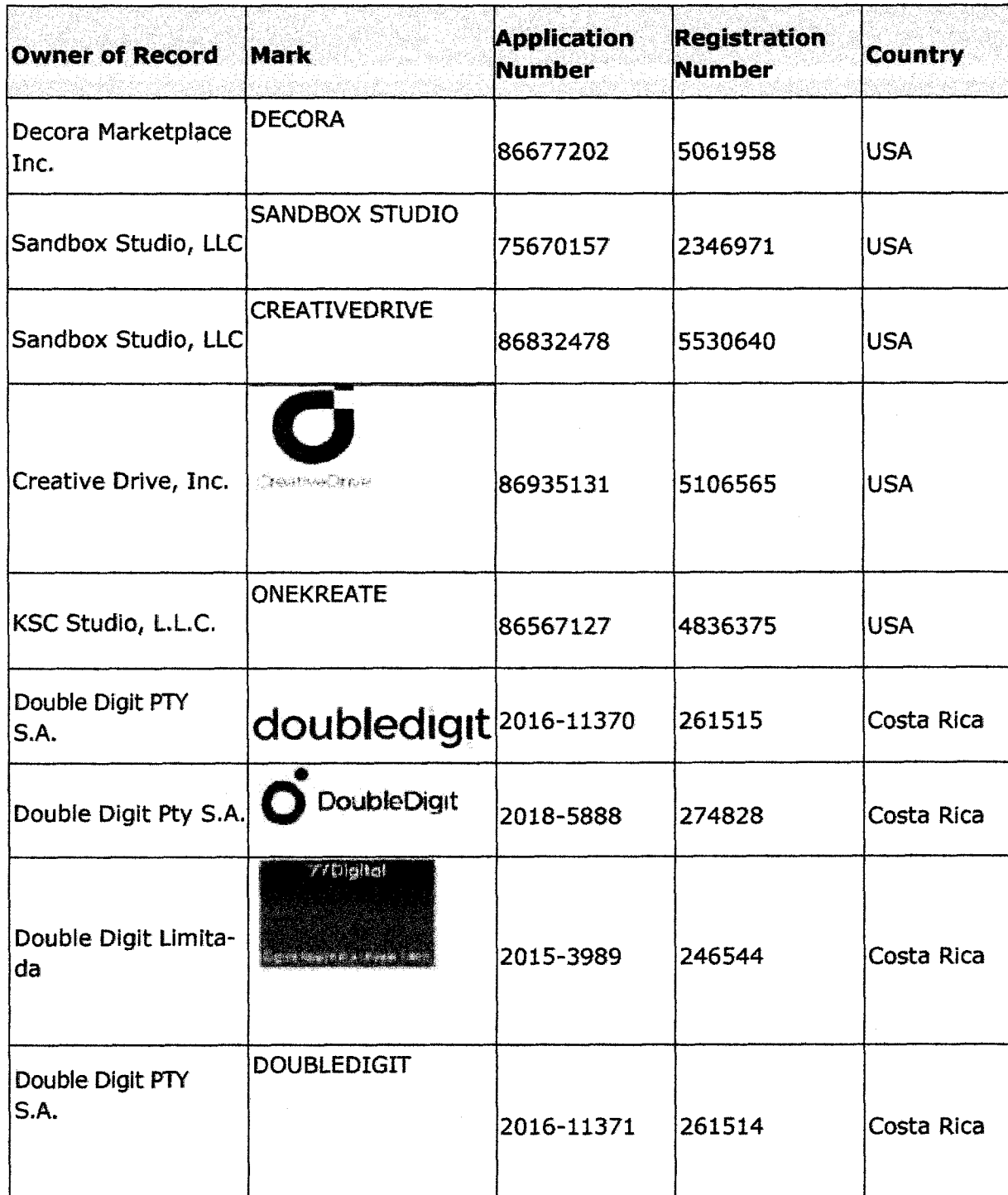
EXHIBIT A Trademark Registrations