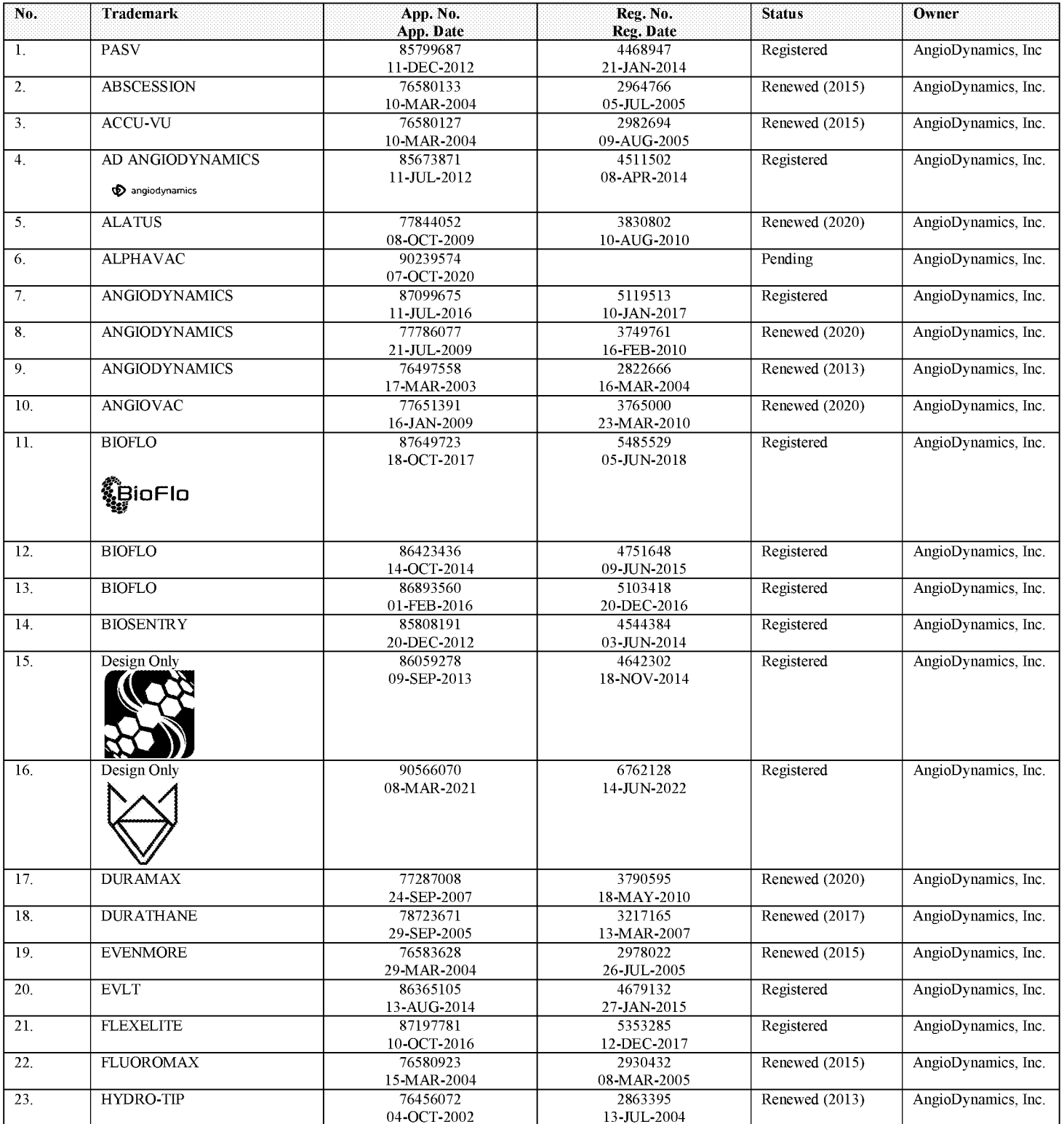
Exhibit A - SCHEDULE OF TRADEMARKS