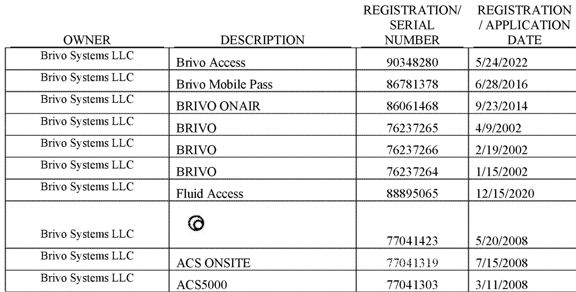
EXHIBIT C TRADEMARKS