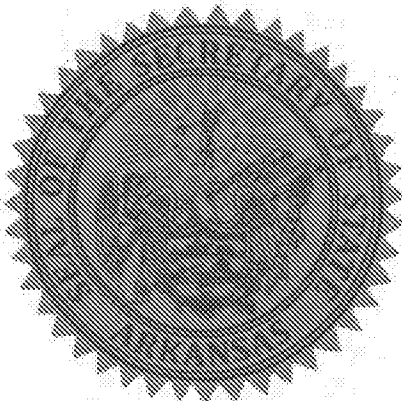
Arkansas Secretary of State

In Testimony Whereof, I have hereunto set my hand and affixed my official Seal. Done at my office in the City of Little Rock, this 28th day of December, 2022.