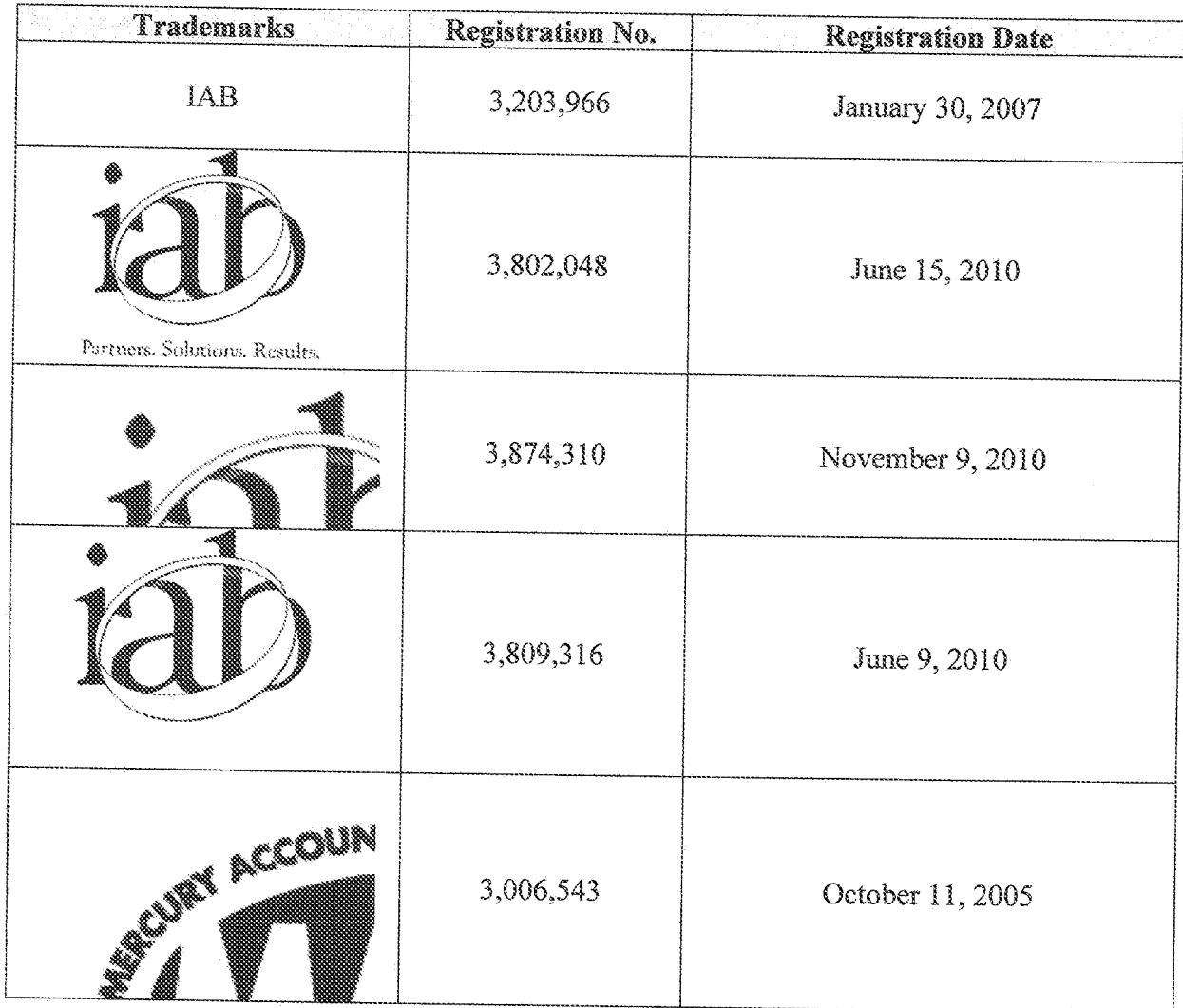
EXHIBIT A TRADEMARKS