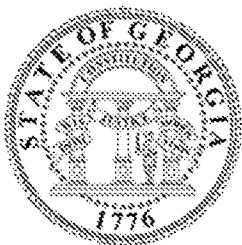
Brad Raffensperger Secretary of State

WITNESS my hand and official seal in the City of Atlanta and the State of Georgia on 03/27/2020 .