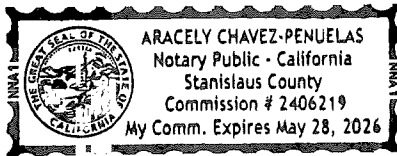
Place Notary Seal and/or Stamp Above

Signature Aracely C. Penueles Signature of Notary Public