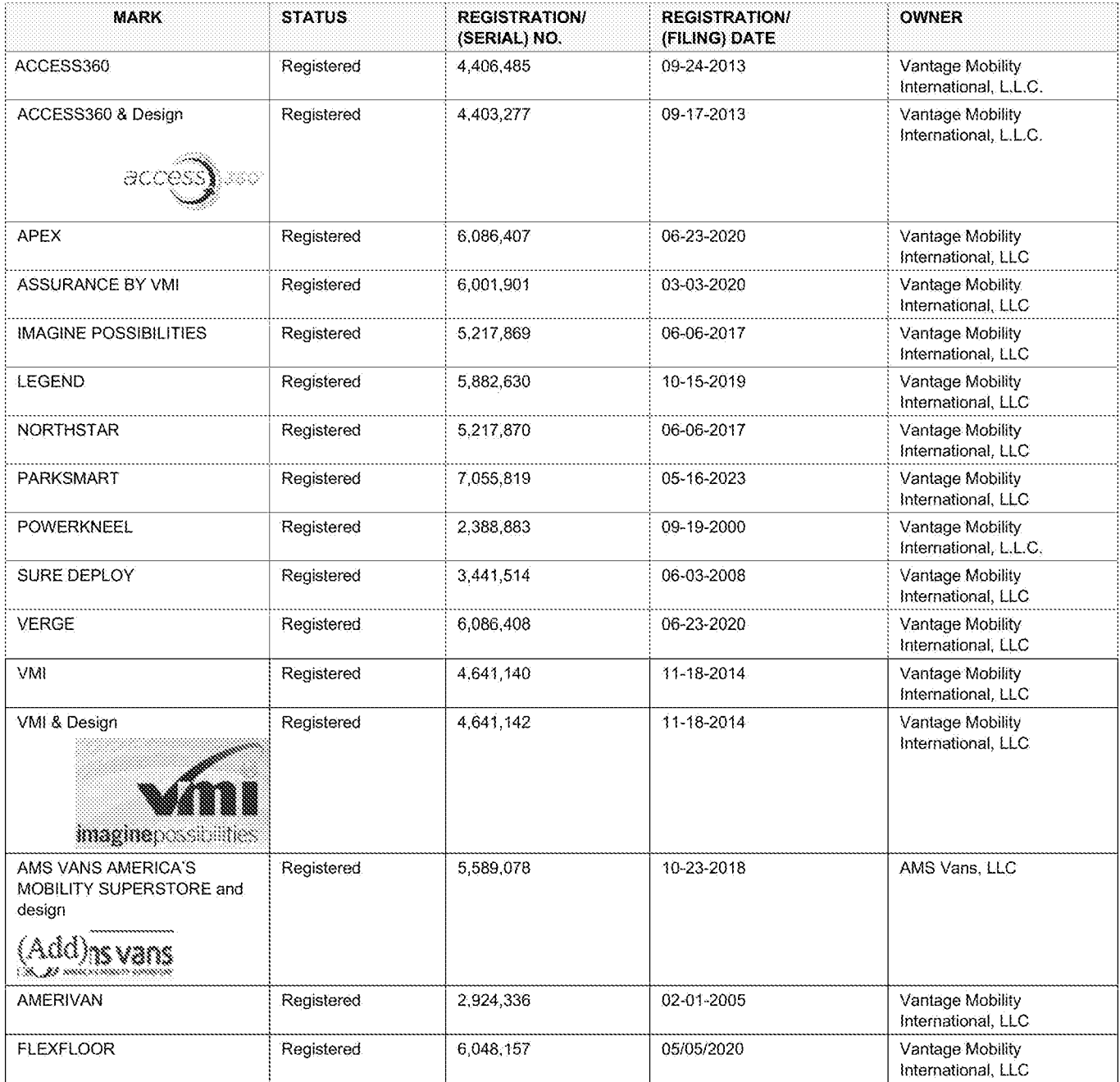
Exhibit A Assigned Trademarks