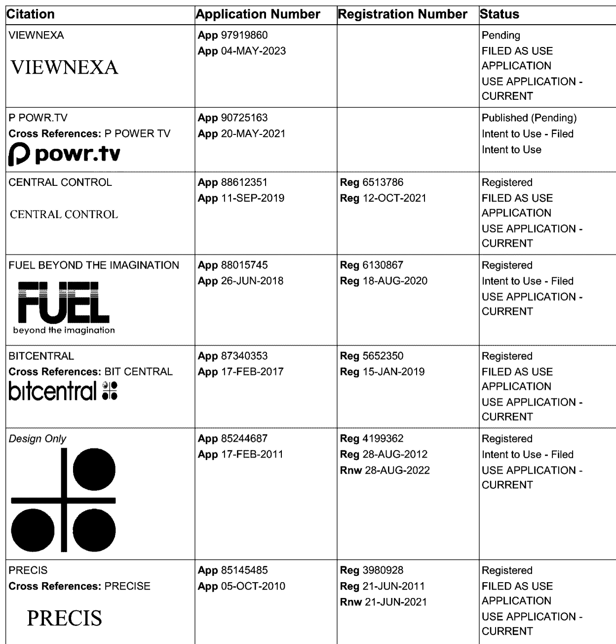
EXHIBIT B TRADEMARKS