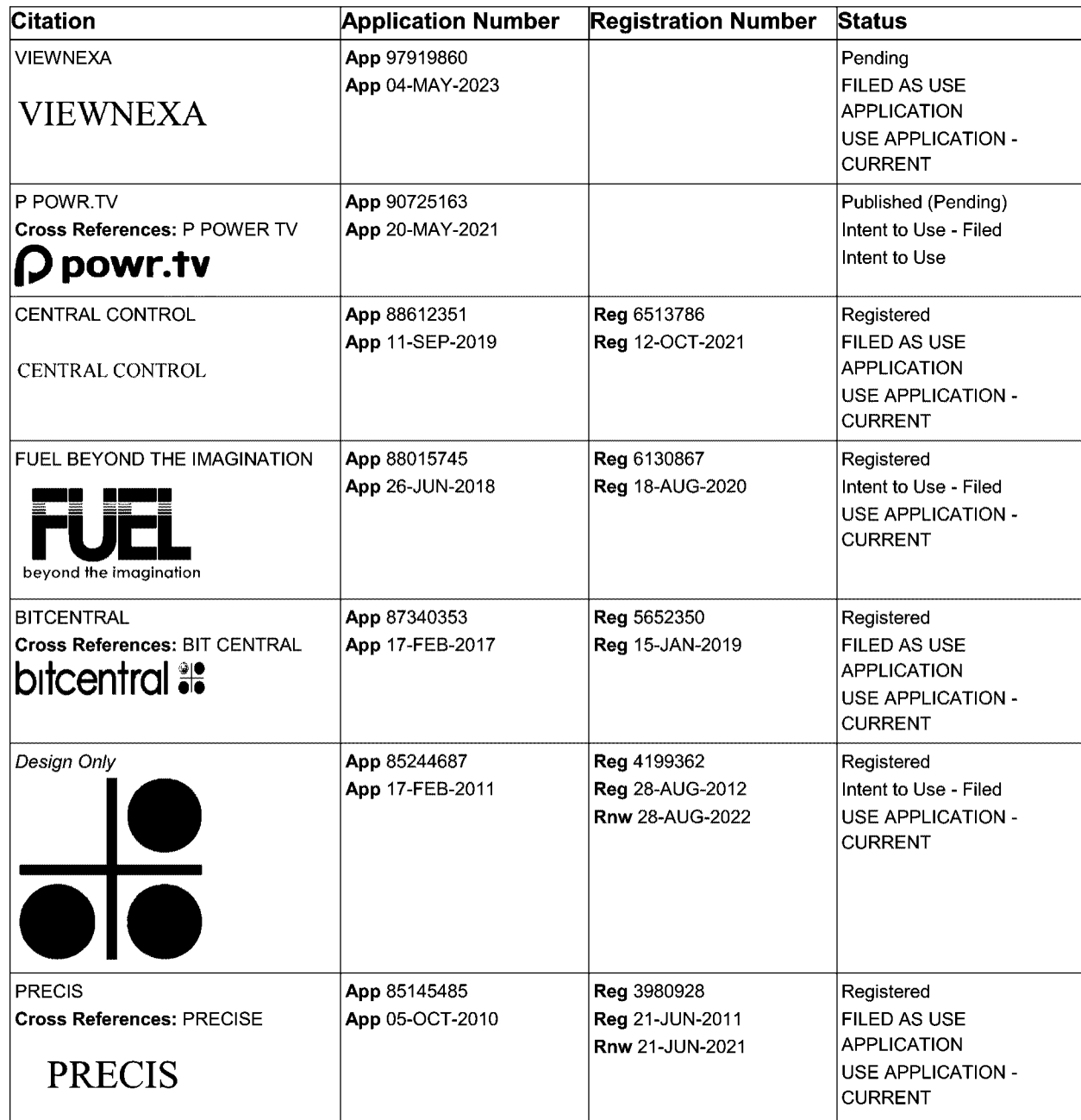
EXHIBIT B TRADEMARKS