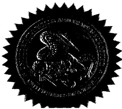
Director of the United States Patent and Trademark Office

This registration shall remain in force for TEN (10) years, unless terminated earlier as provided by law, and subject to compliance with the provisions of Section 8 of the Trademark Act of 1946, as Amended.