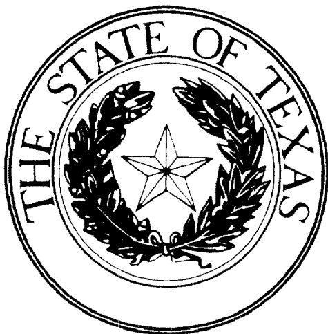
Alberto R. Gonzales Secretary of State