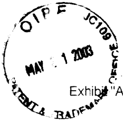
Exhibit "A" attached to that certain Addendum to Intellectual Property Security Agreement dated May 5, 2003.