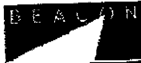
Beacon Horizontal Logo Without Buildings