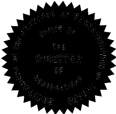
Director of Corporations