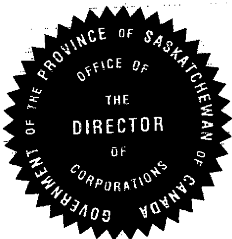
Director of Corporations