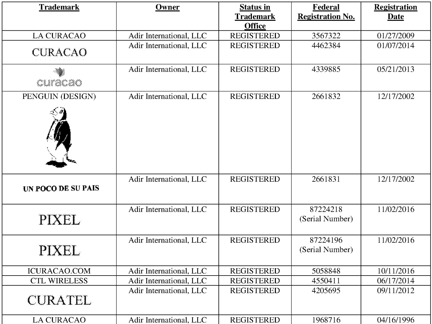
EXHIBIT A TRADEMARKS