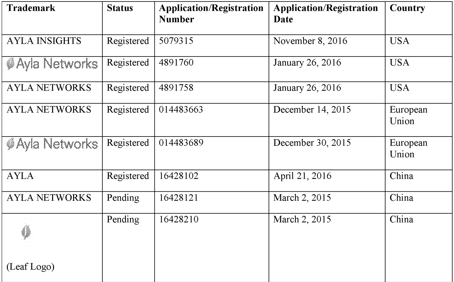
EXHIBIT B TRADEMARKS